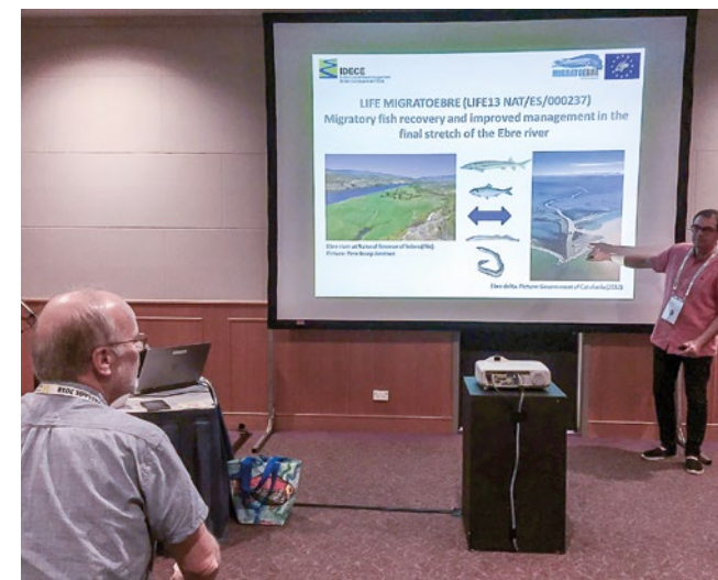
Participation in the Fish Passage Conference in Albury, Australia, on December 10 th , 2018. The first results of the project's assessments of fish movements were presented.