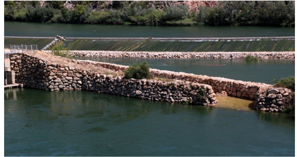
Fishway at Xerta weir.