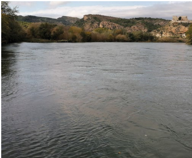
Lower course of the Ebro in good ecological condition (2020).