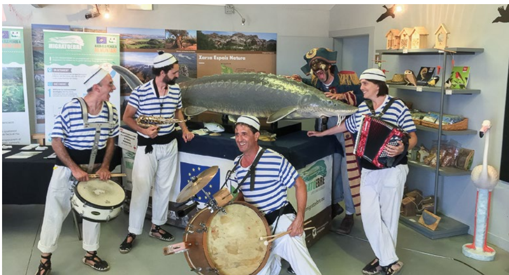
The models of fish, promotional materials and a small exhibit on the project at the Festa dels Menuts at MónNatura Delta. June 30th, 2018.