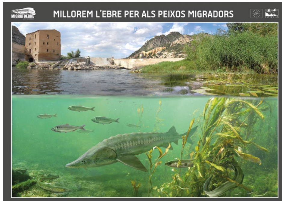
Promotional materials to engage, inform and raise awareness of the LIFE MigratoEbre project among different audiences.

About 20 of these actions were carried out each year, reaching over 100,000 people.