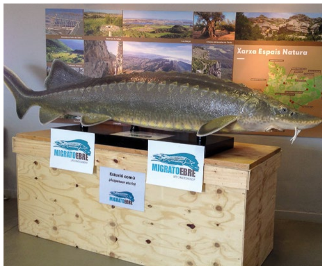
Creation of a life-sized model of a female common sturgeon by sculptor Paco Ventura.