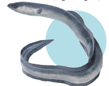
European eel ( Anguilla anguilla )