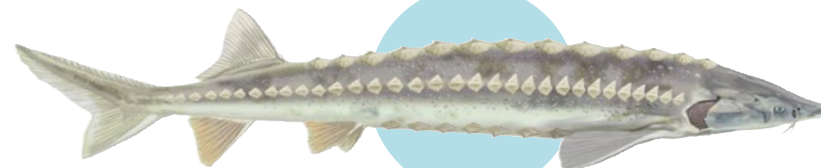
European sturgeon ( Acipenser sturio )