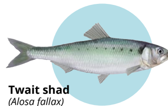
Twait shad ( Alosa fallax )

Some other anadromous fish will also benefit from this project, as will river molluscs like Spencer's freshwater mussel.