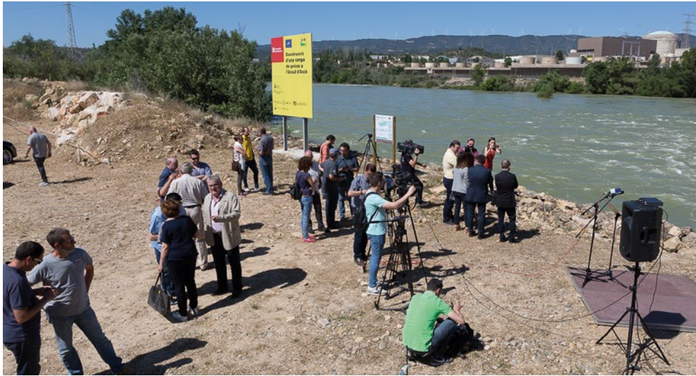
Inauguration of the fishway at Ascó weir on June 15, 2018.