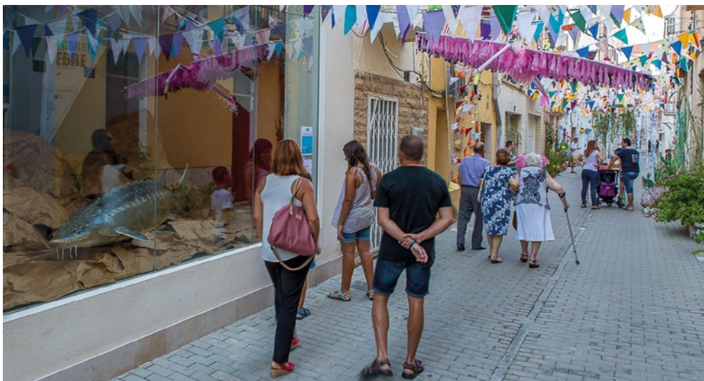
The model of a sturgeon on display at Ampostà's town festival from August 13–25, 2015.