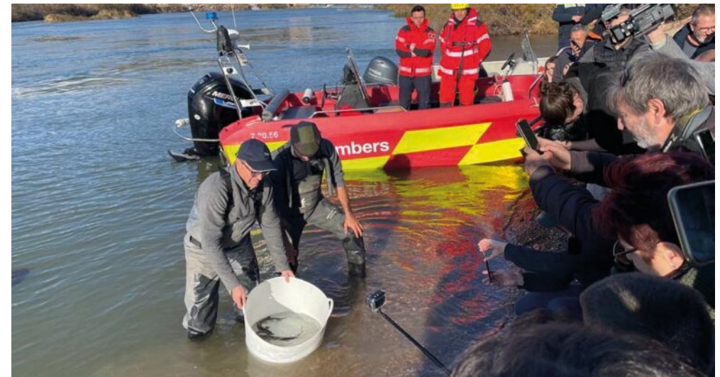
Release of 44 sturgeons in the Ebro River on December 21, 2023, specifically at the Tivenys river beach.