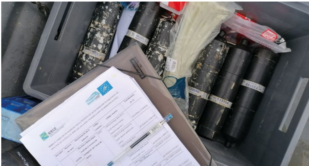
Underwater receivers installed in late October 2023 in the lower course of the Ebro River to track the movements of the sturgeons.