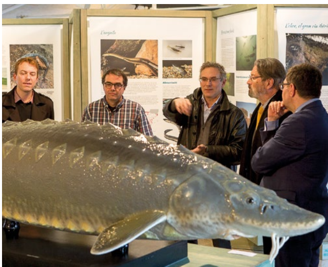
Inauguration of the project's travelling exhibit at the Museu del Ter in Manlleu. This was the first time it was displayed outside the Ebro Lands. March 8th, 2018.