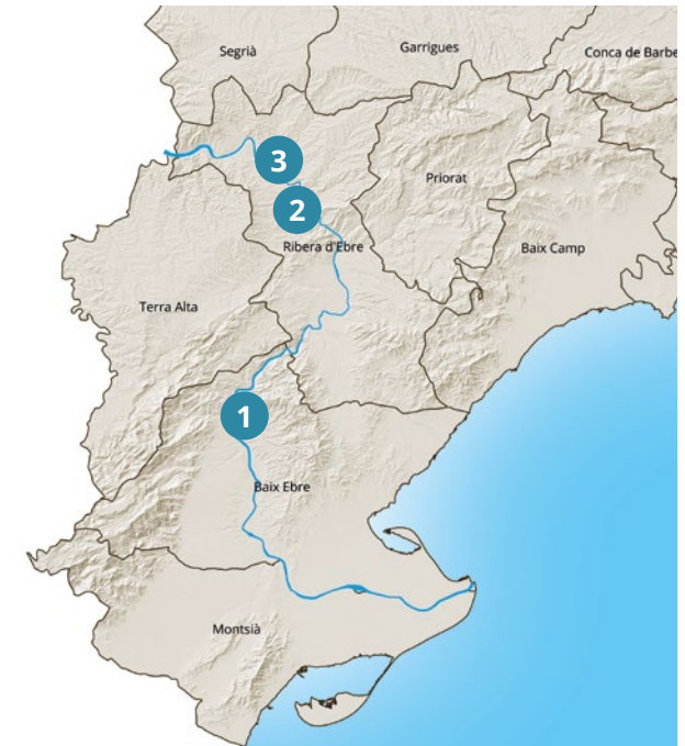
Base map: Cartographic and Geological Institute of Catalonia Prepared by: LaTaula.coop