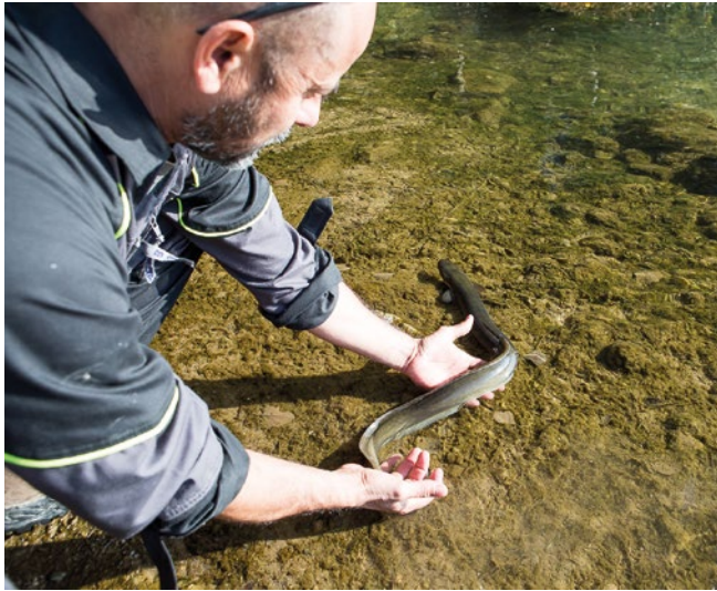
Release of adult eels after they were captured and tagged with radio transmitters to monitor their movements in the Ebro River. This action took place in November 2017.