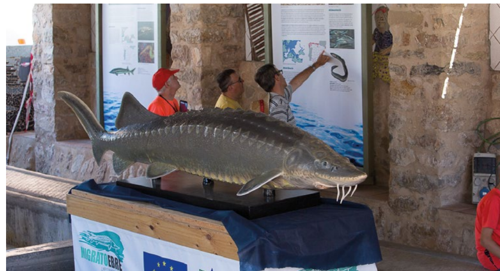
The models of fish, promotional materials and a small exhibit on the project at the Fira Firebre in Benifallet. July 1st, 2017.