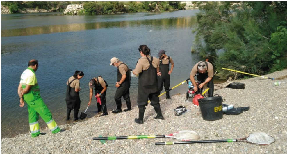
Checking to see if there are any remaining juvenile lamprey populations in the lower course of the Ebro. This was the work of LIFE MigratoEbre technicians and a research team from the University of Santiago de Compostela in September 2018.