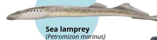
Sea lamprey ( Petromizon marinus )