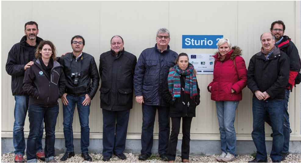
Visit to IRSTEA's facilities in Gironde, Nouvelle-Aquitaine, France, where a cooperation agreement for the provision of sturgeon for the Ebro River was reached on March 26, 2015.