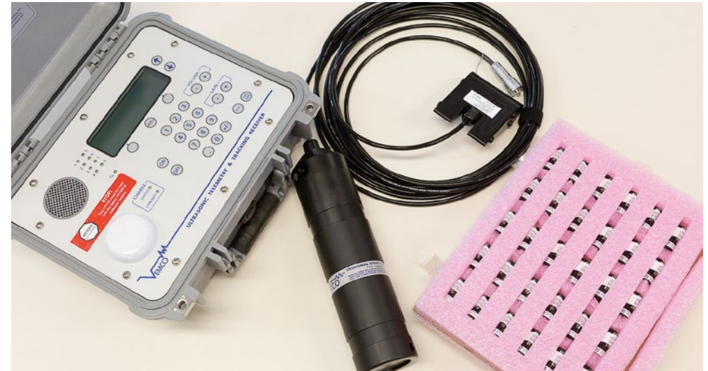
Ultrasonic transmitters and receivers used to facilitate the data collection from tagged specimens.