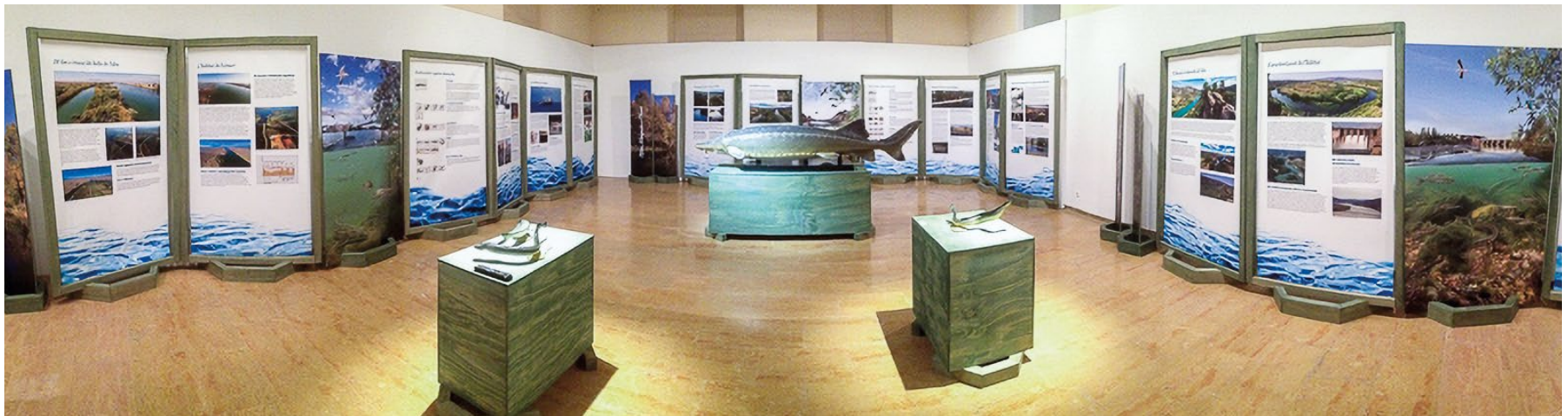
Inauguration of the project's traveling exhibit at the Museu de les Terres de l'Ebre in Amposta. July 21st, 2016.