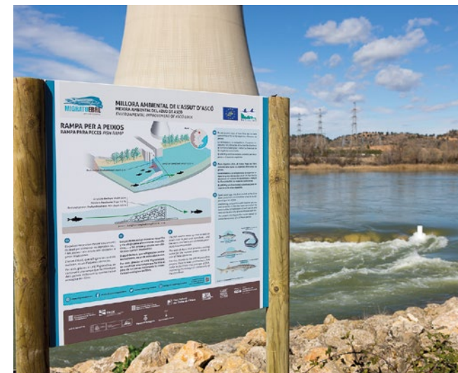
Design and installation of an informational panel at the Ascó fishway.