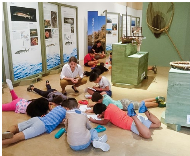
School visit to the travelling exhibit on the LIFE MigratoEbre project in September 2016. The visit was enhanced with educational materials made specifically for the project.